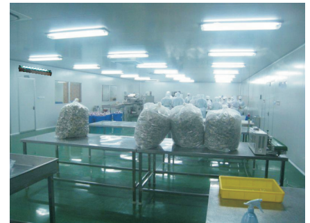
Food processing plants